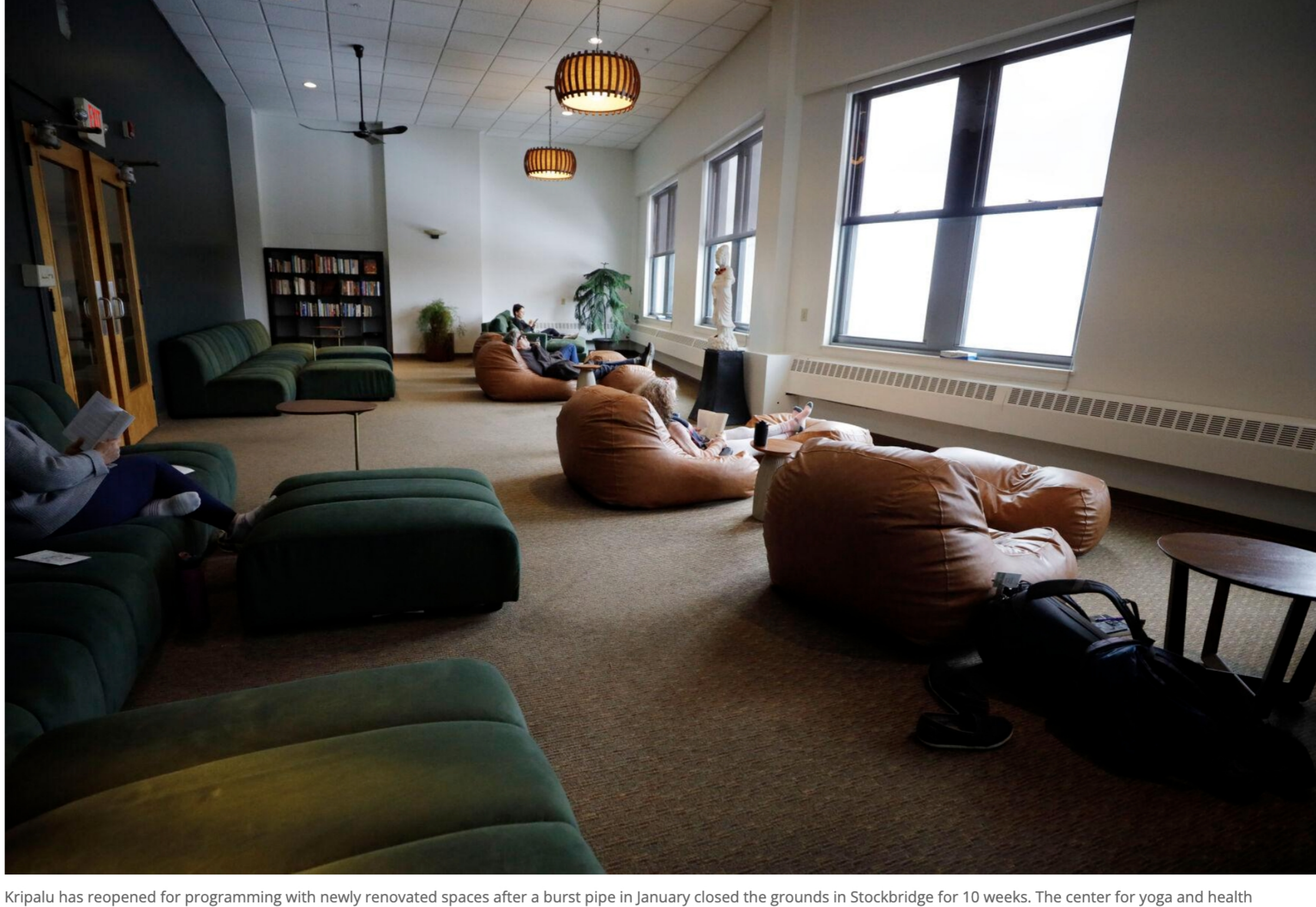
Kripalu has reopened for programming with newly renovated spaces after a burst pipe in January closed the grounds in Stockbridge for 10 weeks. The center for yoga and health welcomed 450 guests, full capacity, on reopening weekend.

By Clarence Fanto, The Berkshire Eagle Apr 9, 2024 2 min to read