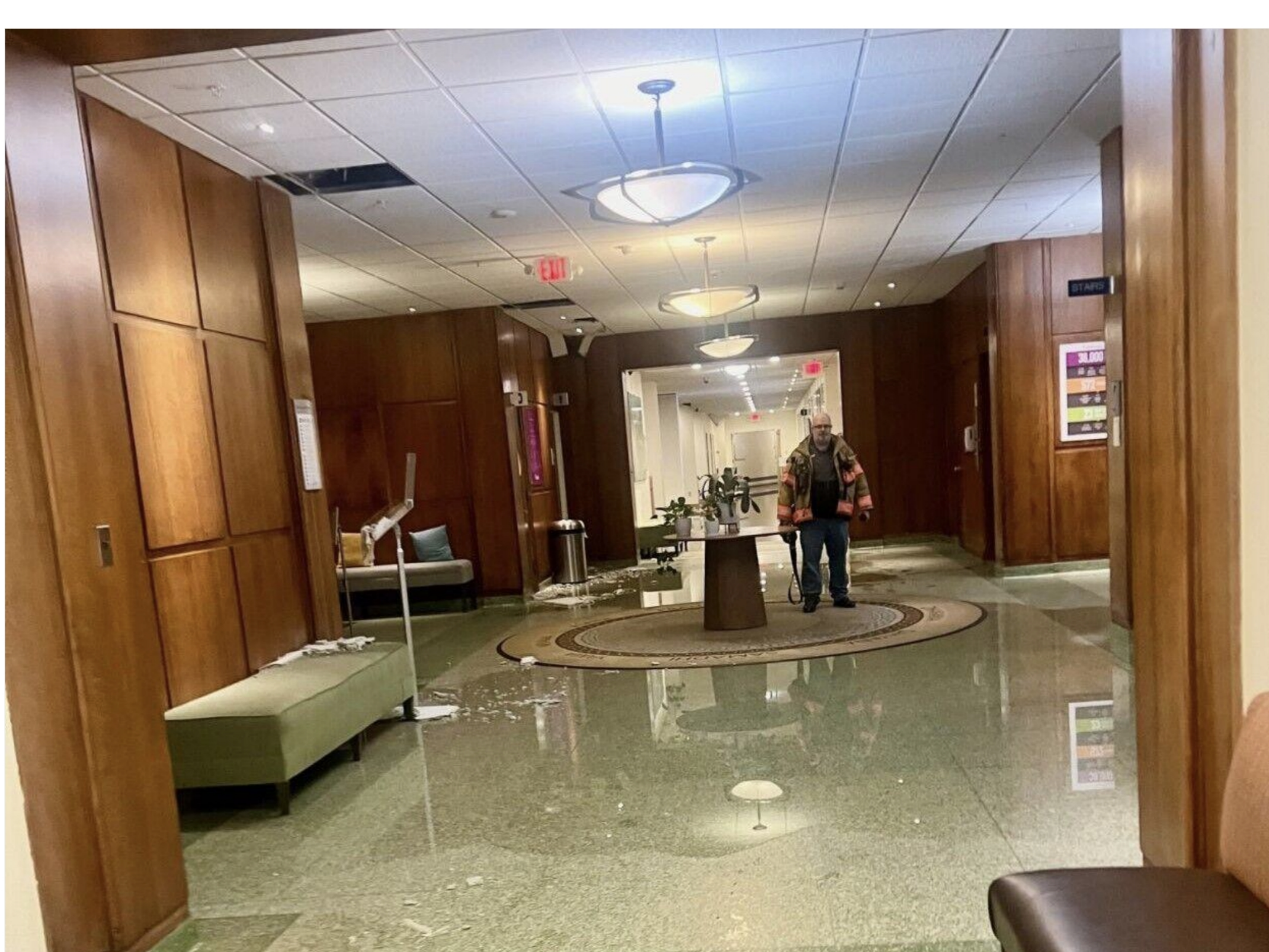
Flooding damage at Kripalu was more extensive than initially believed. When will the yoga and health center reopen? After decades as a powerful music executive and Alicia Keys' manager, the yoga and health center in Stockbridge is spending more than $100,000 on critical repair and restoration work, especially to waterlogged electrical systems.