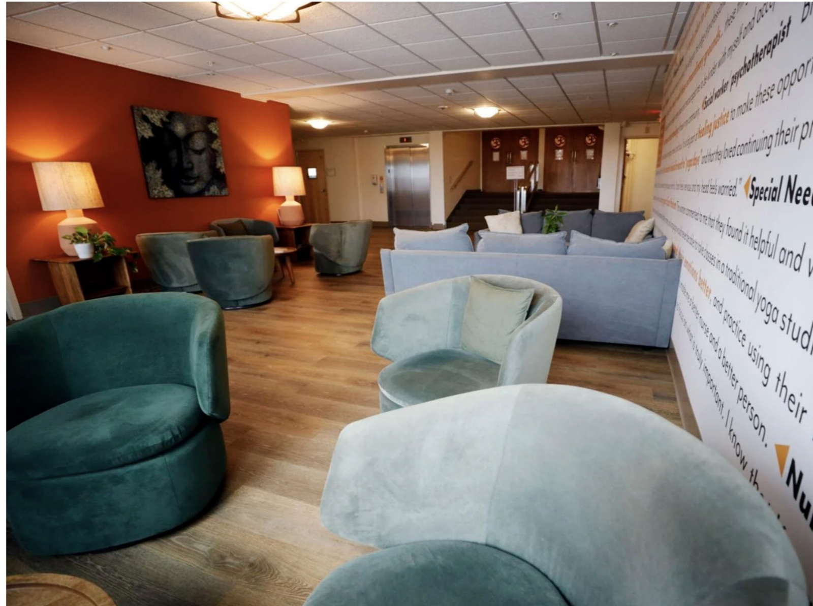
Kripalu Yoga & Health Center in Stockbridge spent an undisclosed amount on extensive repairs and renovations following a damaging flood caused by a burst pipe on Jan. 20.

"This whole area had to be redone, but it looks beautiful," he said. "A tremendous amount of work was needed, and the team did a phenomenal job to make it all happen."