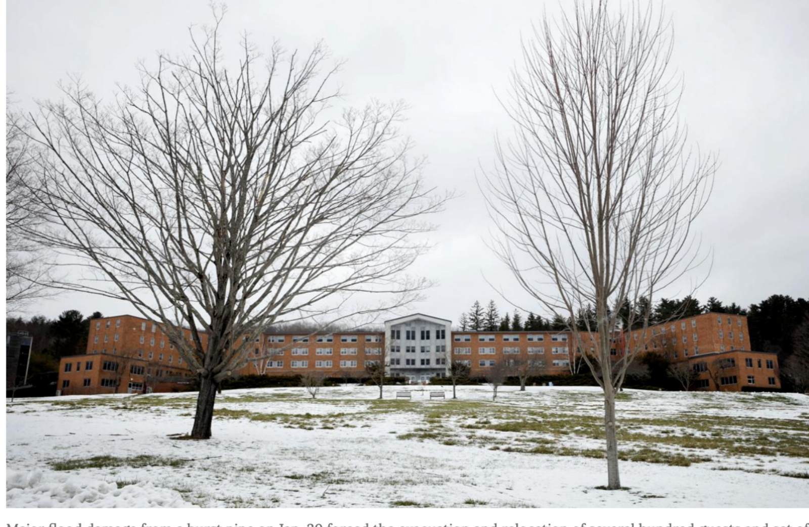
Major flood damage from a burst pipe on Jan. 20 forced the evacuation and relocation of several hundred guests and set off a 10-week shutdown of Kripalu Center for Yoga & Health.

The makeover includes not only the lobby, but also locker rooms, executive and staff offices, the call center where staffers handle phone reservations, hideaway retreat spaces for guests who need to maintain tech contact with the outside world, and the revamped main dining hall that was ground zero for the flood.